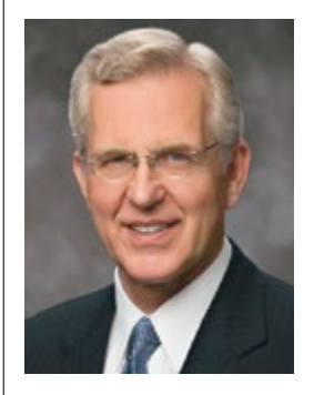
By Elder D. Todd Christofferson Of the Quorum of the Twelve Apostles