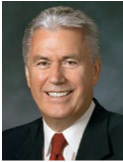
By President Dieter F. Uchtdorf Second Counselor in the First Presidency