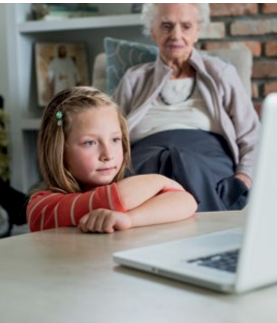
Raymond, Alberta, Canada

Why is this? Because we are made of the stuff of eternity. We are eternal beings, children of the Almighty God, whose name is Endless 13 and