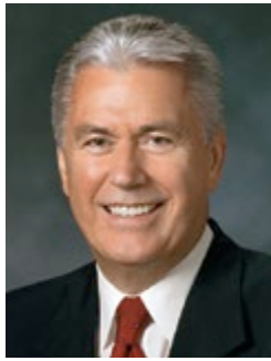
By President Dieter F. Uchtdorf Second Counselor in the First Presidency

I testify that this is the Lord's Church. You were chosen to participate in His work at this time because He trusts you to make the right choices. You are the choice generation. In the name of Jesus Christ, amen. ■