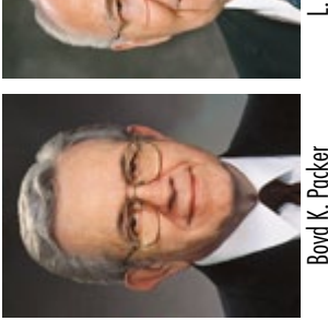
THE QUORUM OF THE TWELVE APOSTLES