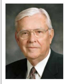
By Elder M. Russell Ballard Of the Quorum of the Twelve Apostles