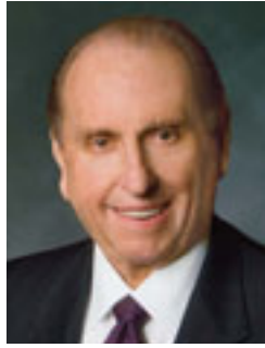
Fai 'e Palesiteni Thomas S. Monson